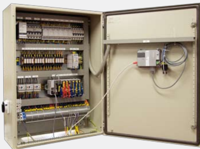
Cabinet. Euronom has developed a solution with separated control and power current, which simplifies maintenance and installation of options.

ExoTrol Pro is available in two versions; one for control of maximum three heat pumps and one for maximum five heat pumps, connected to one or two accumulator tanks. ExoTrol Pro controls up to three different forms of energy with power supply from a separate cabinet. ExoTrol Pro has a large number of presets and several additional functions can be programmed. Floating or fixed condensing can be applied up to the regulation point. ExoTrol Pro is easy to connect via ModBus communication, 3G router or fixed network for monitoring as well as regulation.