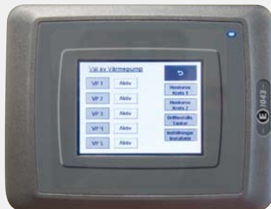
Operation panel. Touch screen for easy adjustment of settings.